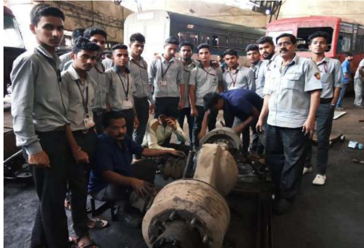
Students at depot workshop with ST depot Mechanical Engineers

Company: Maharashtra State Transport Depot, Ramwadi on 10 Aug 2019.