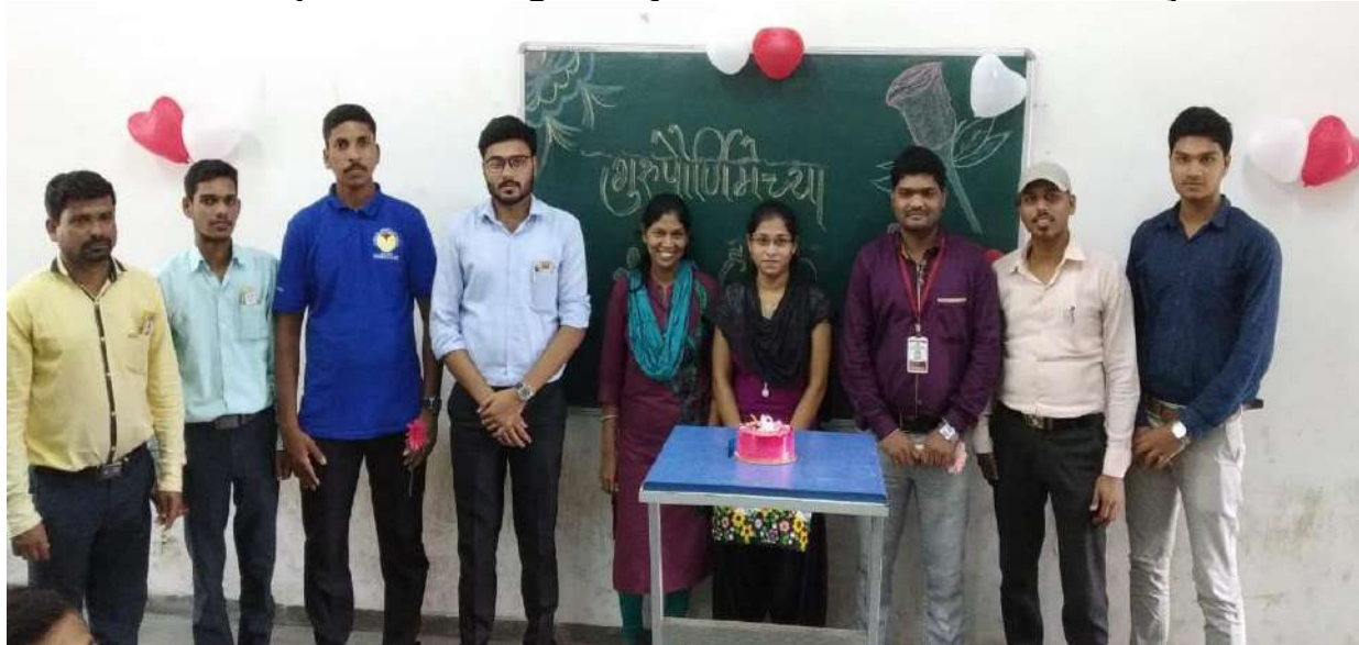
Mechanical Engineering Department staff (Gurupournima)

Department of Mechanical Engg. Conducted Guru Pournima event on. In which gifts for teachers of all departments are given by the students of mechanical department.