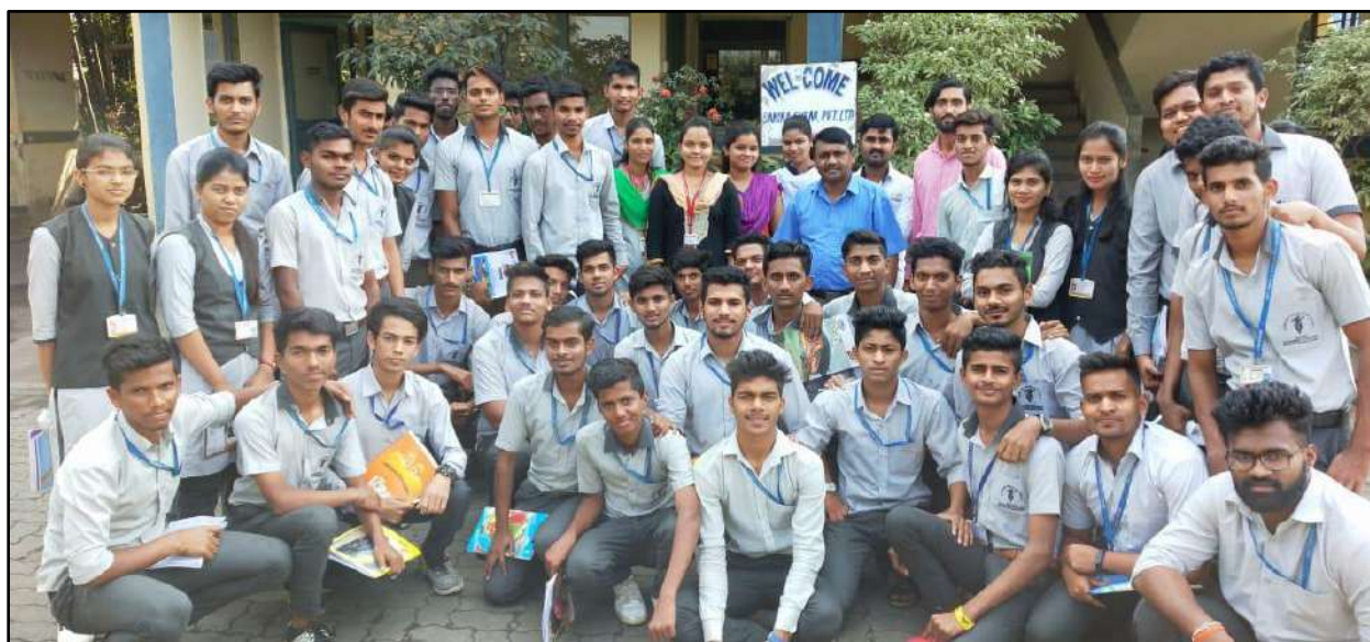
Sanika Chemicals Pvt. Ltd., Mahad

Our Second Year and Third Year Students visited to following industries: