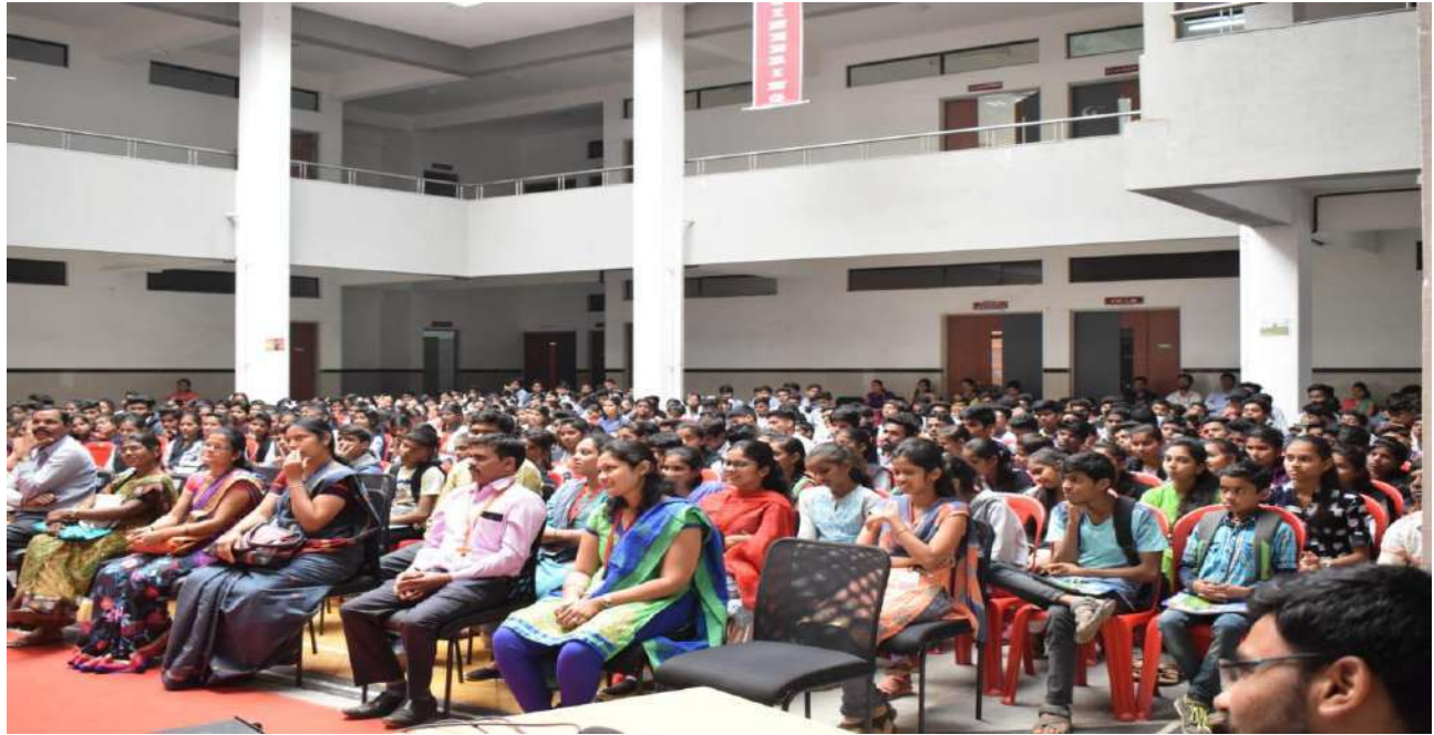
CARRIER FAIR ORGANISED BY OUR INSTITUTE