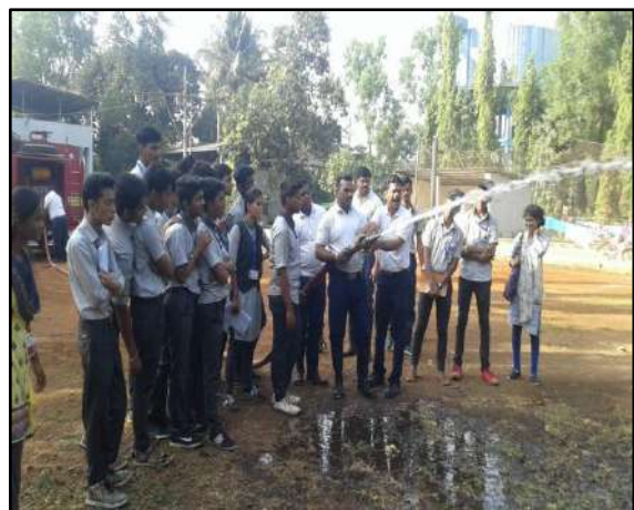
Maharashtra Industrial Development Corporation (MIDC), Roha.