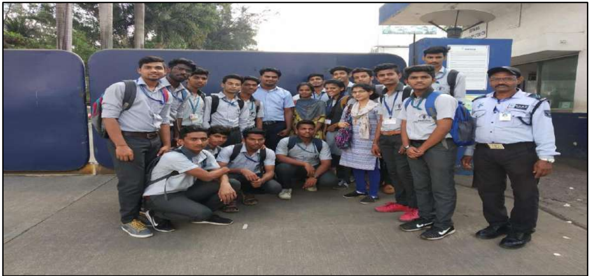
Pepsico India Holdings Pvt. Ltd., Dhatav-Roha