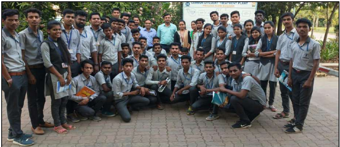
Common Effluent Treatment Plant (CETP), Mahad